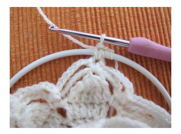
Work 1 sc inserting your hook under the circle and through one ch-3 space in the last round of the largest flower.

Work one or two sc around the circle, leaving a relatively long yarn tail. Insert your hook under the cercle, as you would with a ring of chain stitches at the beginning of a motif worked in the round.